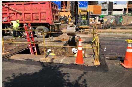
Excavation for Site Utilities